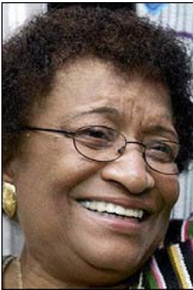
"The Iron Lady"

Ellen Johnson-Sirleaf was elected Liberia's 21st president; the first woman to be democratically elected in Africa in the 21st century.