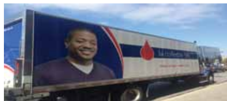
Truck from Hema-Québec