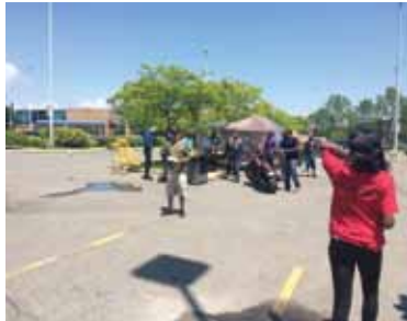
Hilarious Riders' Bar-b-q

Saturday, June 13th turned out to be a beautiful, sunny day. Perfect, not only for the Dr. Charles Drew Blood Drive, but for the outdoor bar-b-q. This was possible thanks to BCRC's partnership with the Hilarious Riders. This group of young professionals have created quite a buzz on their motorcycles fundraising for worthy projects in Montreal and abroad. Through their initiative they got numerous sponsors, including tapping into the generosity of our neighbour, Maxi, who provided the food and even allowed Hilarious Riders to use their parking lot to flip the burgers and grill the hot-dogs. The bar-b-q attracted a whole new crowd to the drive in our center--exactly what it was intended to do. We are happy to announce that the Blood Drive was a smashing success. We surpassed our goal of 75 and reached 92 donors.