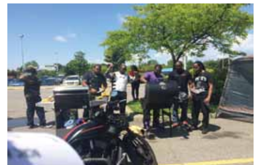
Hilarious Riders hard at work