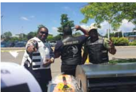
Hilarious Riders hard at work