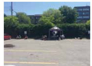
Bar-b-q DJ Station