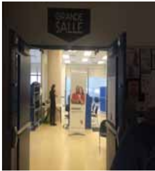
Grande Salle of the CRC, where the blood drive was held